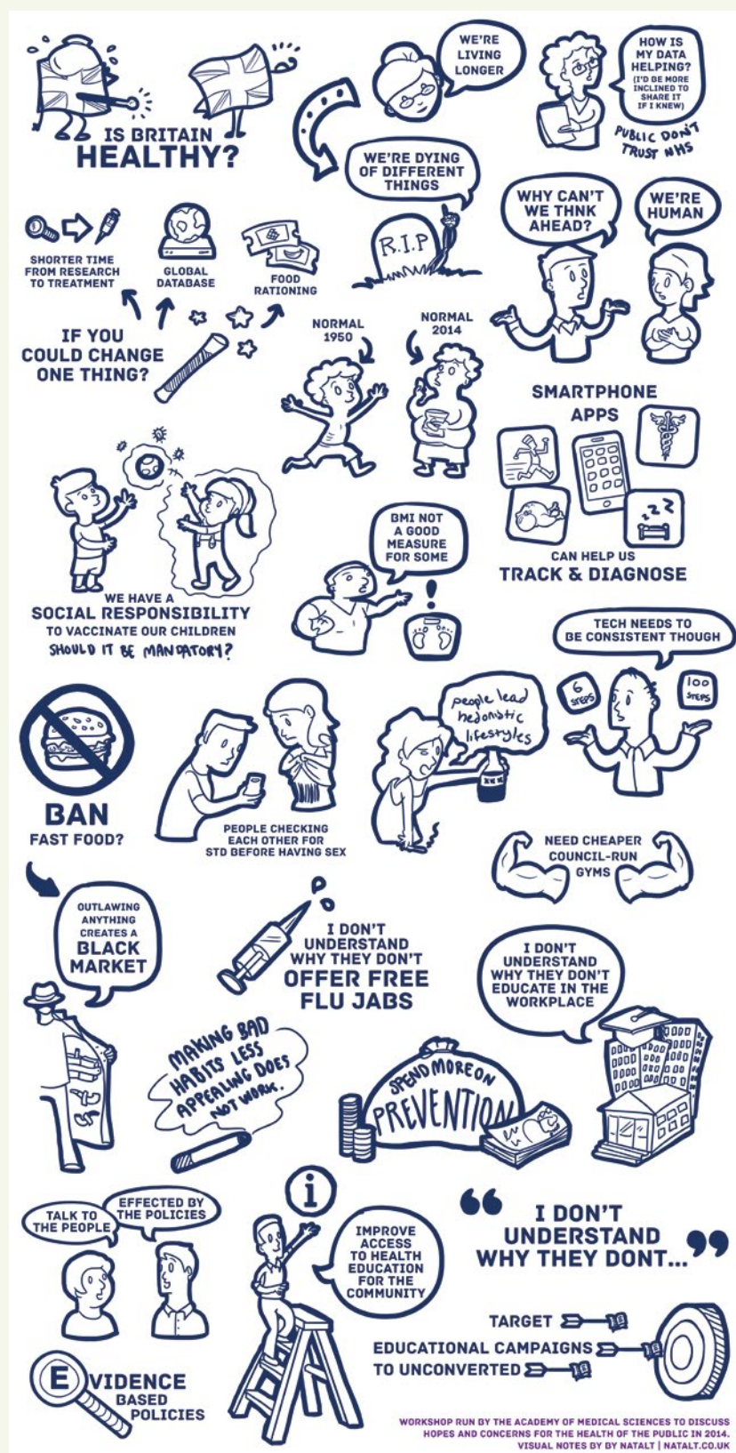
Figure 3. Public dialogue: visual note-taking